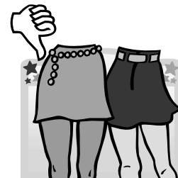
(No too-short skirts or shorts.)