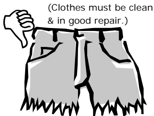
(Clothes must be clean & in good repair.)