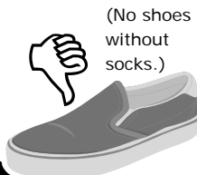
(No shoes without socks.)