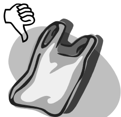
(No exposed shoulders.)