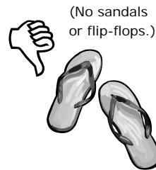
(No sandals or flip-flops.)