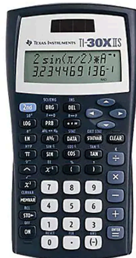
TI 30X IIS Scientific Calculator (8th Grade)